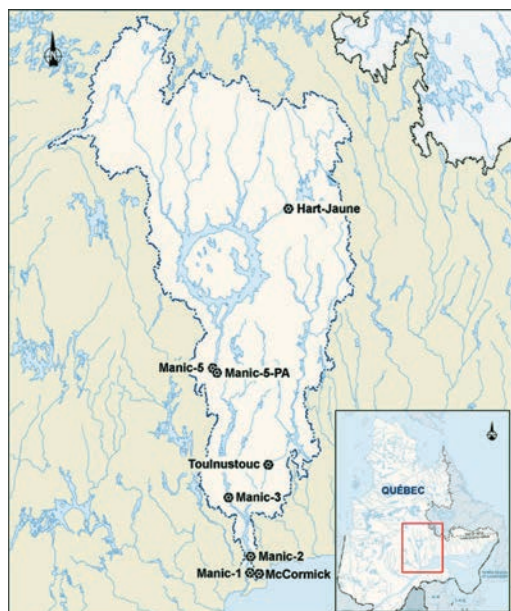
Figure 1. Manicouagan River Drainage Basin (Hydro-Québec).

Figure 1. Bassin versant de la rivière Manicouagan (Hydro-Québec).