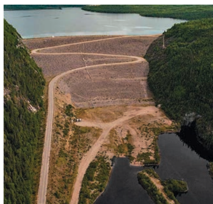
Figure 4. Manicouagan-3 Main Dam Aerial View (Hydro-Quebec).

Figure 3 shows the cross section of the embankment dam with a central till core and sand and gravel shoulders. The positive cutoff consists of two 600 mm thick concrete walls made