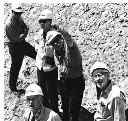
From l. to r. (Taken from Hydro-Presse, June 1973)